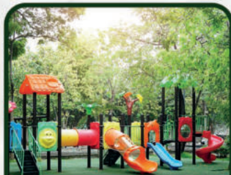
Childrens Play Area