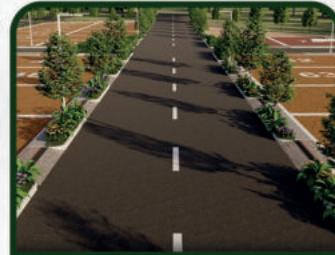
Avenue Trees & Black Top Road