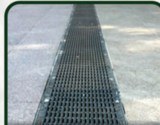
Storm Water Drainage