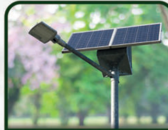
Solar Street Lights